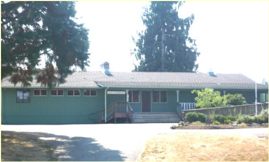
We will meet for the Passover-Unleavened Bread Retreat at the Pitchford Boys' Ranch Meeting Hall (pictured above).