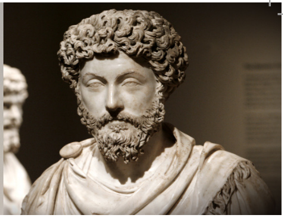
Justin Martyr (100-165 AD) (above)

person went to heaven when they died became a common, pagan teaching. Consider the following statement by the ancient Greek historian, Herodotus: